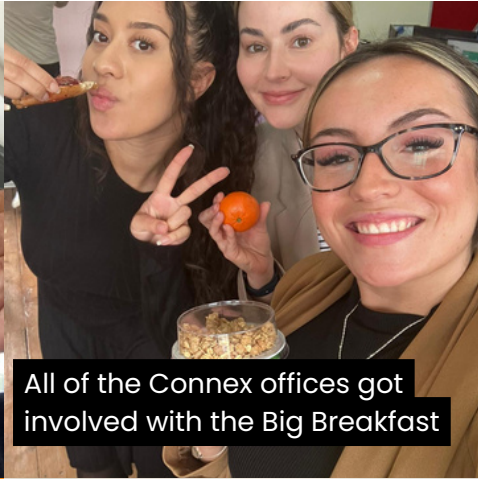
All of the Connex offices got involved with the Big Breakfast